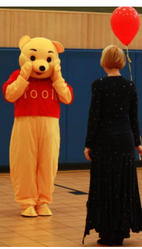
These were held at: