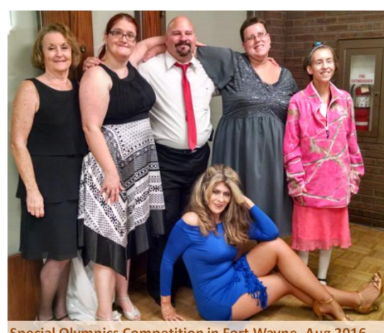
Special Olympics Competition in Fort Wayne, Aug 2016

The program consists of three main components: Fundraiser, ballroom training and Competition. The Heartland volunteers are actively involved in all aspects of the program: the SO annual Big Ballroom Bash Fundraiser, as well as the training and competition with the SO athletes at the SO Annual Competition in Fort Wayne, IN. This year, the SO competition took place in August 2016, and hosted 25 SO couples.